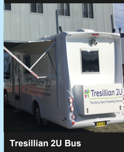
Tresillian 2U Bus