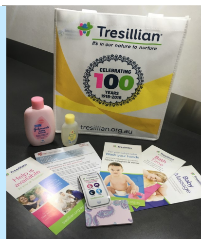
Tresillian visitor goodie bag